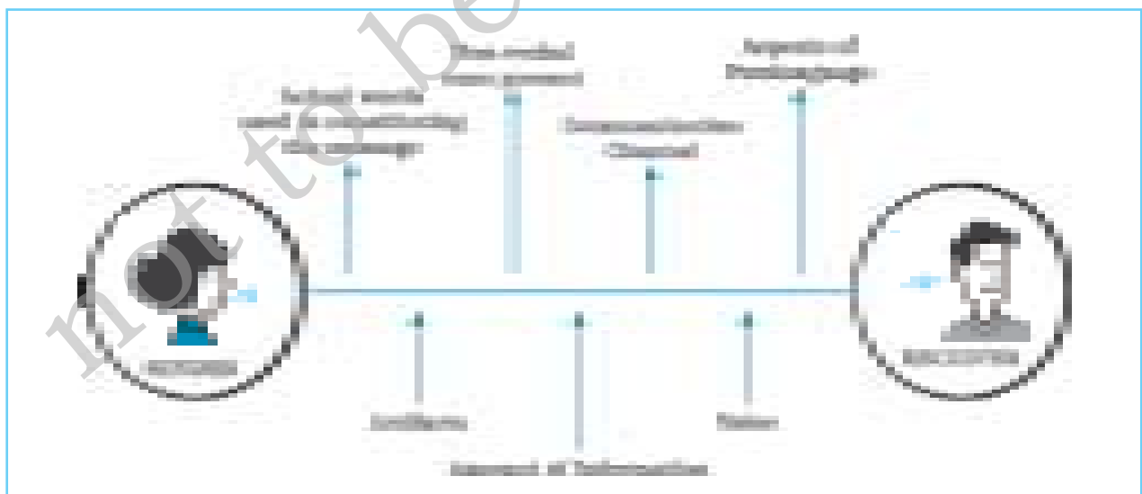
Fig.9.1 : Basic Communication Process

One important component of communication is speaking with the use of language. Language involves use of symbols which package meaning within them. To be effective, a communicator must know how to use language appropriately. Because language is