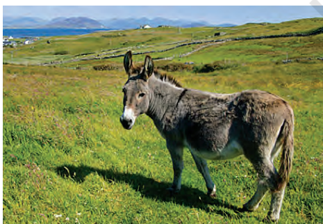
Figure 9.2 Mule

Controlled breeding experiments are carried out using artificial insemination . The semen is collected from the male that is chosen as a parent and injected into the reproductive tract of the selected female by the breeder. The semen may be used immediately or can be frozen and used at a later date. It can also be transported in a frozen form to where the female is housed. In this way desirable matings are carried. Artificial insemination helps us overcome several problems of normal matings. Can you discuss and list some of them?