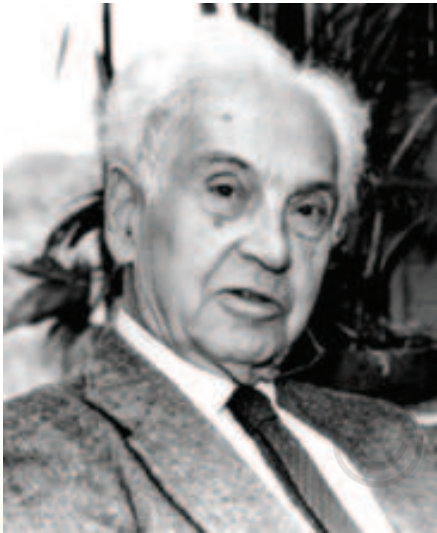
Ernst Mayr (1904 – 2004)

Born on 5 July 1904, in Kempten, Germany, ERNST MAYR, the Harvard University evolutionary biologist who has been called 'The Darwin of the 20 th century', was one of the 100 greatest scientists of all time. Mayr joined Harvard's Faculty of Arts and Sciences in 1953 and retired in 1975, assuming the title Alexander Agassiz Professor of Zoology Emeritus . Throughout his nearly 80-year career, his research spanned ornithology, taxonomy, zoogeography, evolution, systematics, and the history and philosophy of biology. He almost single-handedly made the origin of species diversity the central question of evolutionary biology that it is today. He also pioneered the currently accepted definition of a biological species. Mayr was awarded the three prizes widely regarded as the triple crown of biology: the Balzan Prize in 1983, the International Prize for Biology in 1994, and the Crafoord Prize in 1999. Mayr died at the age of 100 in the year 2004.