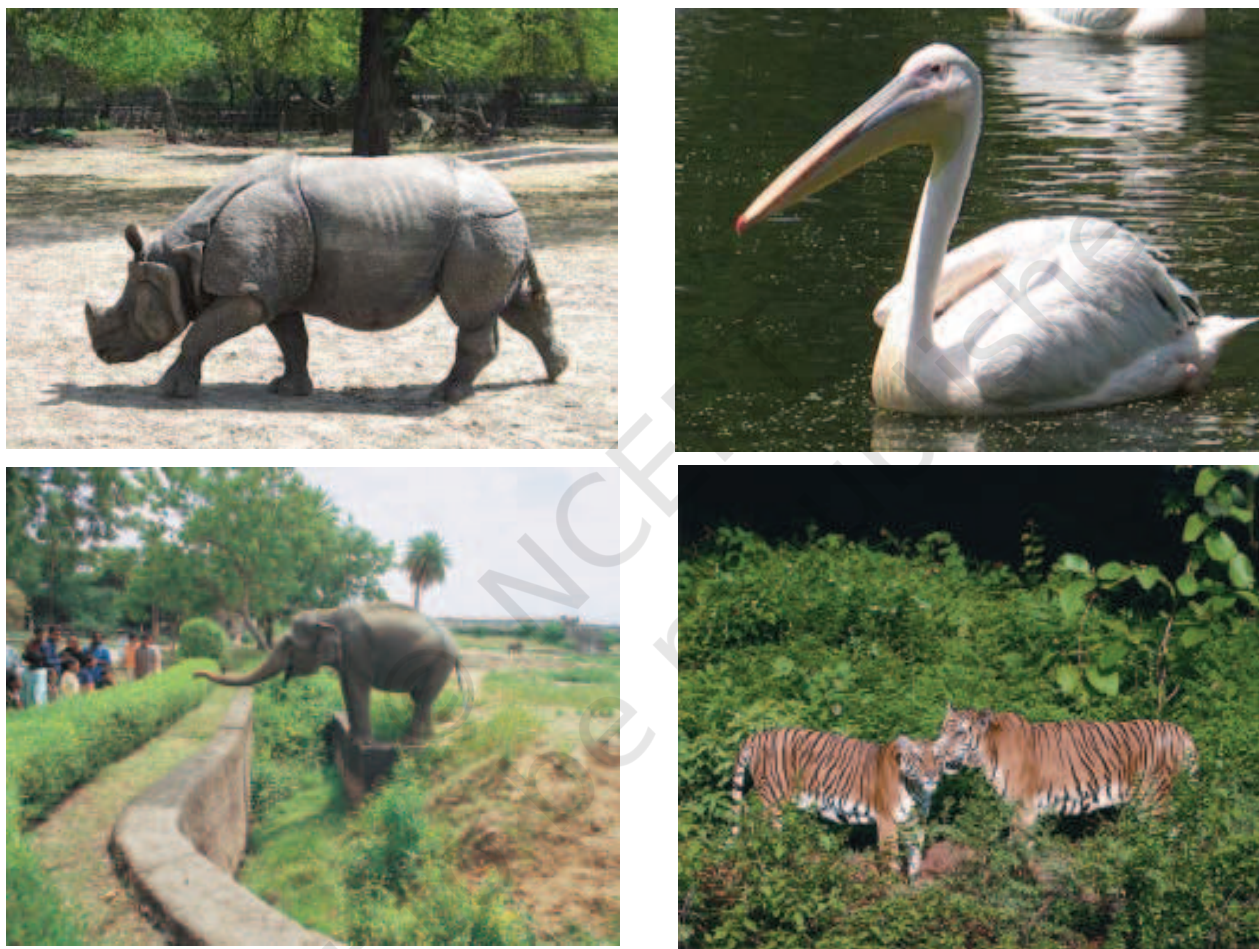
Figure 1.3 Pictures showing animals in different zoological parks of India

These are the places where wild animals are kept in protected environments under human care and which enable us to learn about their food habits and behaviour. All animals in a zoo are provided, as far as possible, the conditions similar to their natural habitats. Children love visiting these parks, commonly called Zoos (Figure 1.3).